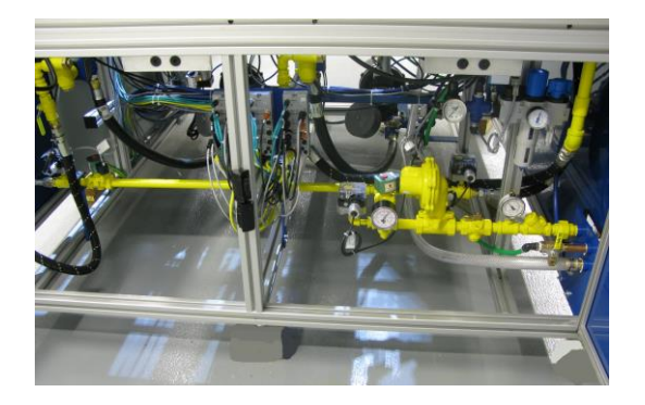
Hinged doors provide easy access to utility and heat controls.