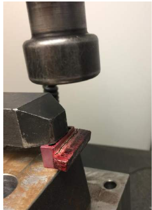
Segments brazed with Fusion Braze Paste average over 2,800 (lbf) shear strength, 40% stronger than parts brazed manually